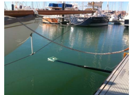
DUMO Algacleaner installation